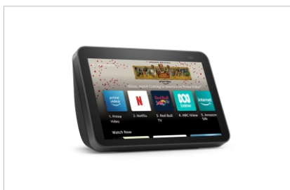
Winner 2: Echo Show 8, 2nd Gen, 8"