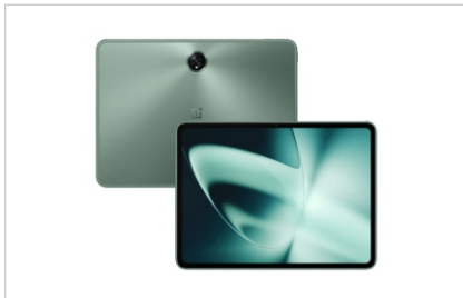
Winner 1: OnePlus Tab 11.6"