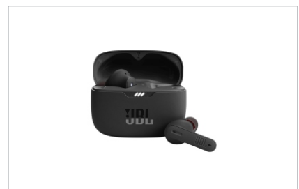
1st Runner Up : JBL Tune 230NC-Earbuds