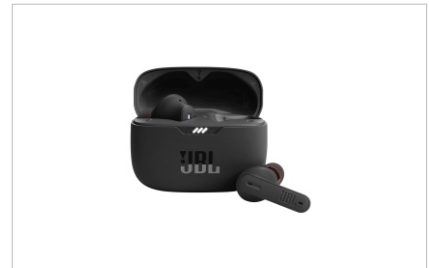
1st Runner Up : JBL Tune 230NC-Earbuds