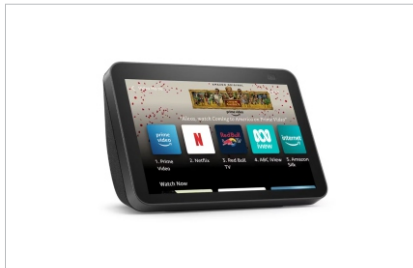
Winner 2: Echo Show 8, 2nd Gen, 8"